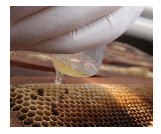
Fig. 2: Rambutan honey samples isolation technique