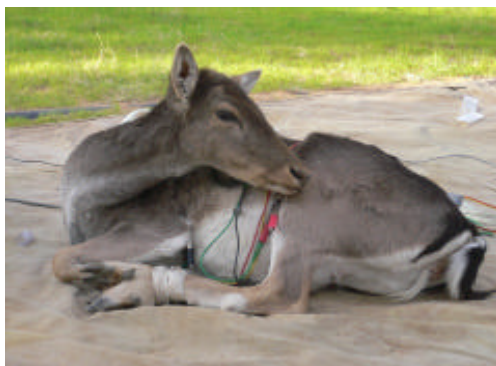
Fig. 1: The calming effects of acepromazine

Tongue and ear reflexes decreased and became moderate 10 and 15 min, respectively after the injection of acepromazine and became mild 30 min after the injection of ketamine and gradually increased until returning to the normal level at the end of the study (Table 1). Pedal and anal reflexes became moderate 15 min after the administration of acepromazine and became almost mild 30 min after the administration of ketamine and gradually elevated until the end of the study (Table 1). Jaw reflex