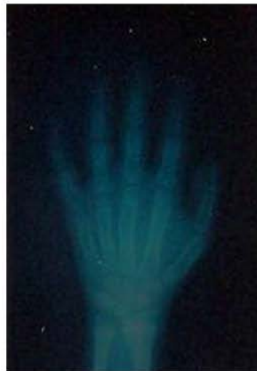
Fig. 3: Hand-wrist radiography of a nine-year-old female patient