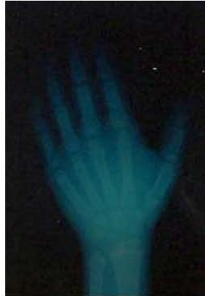
Fig. 1: Hand-wrist radiography of a nine-year-old male patient with chronic renal failure