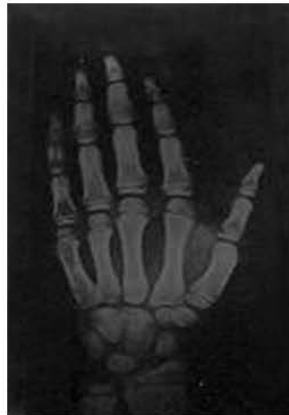
Fig. 2: Image of a normal nine-year-old male according to the Greulich-Pyle atlas